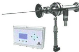
Steam Quality Metering