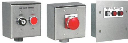
Gas Relay Control Panels & Shut Off Valves