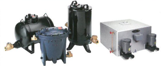
Condensate Handling Equipment