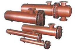
Shell & Tube Heat Exchangers and Bundles