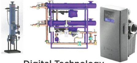
Digital Technology for Water Heating and Temperature Control

Education's Partner in Energy and Facilities Management Equipment