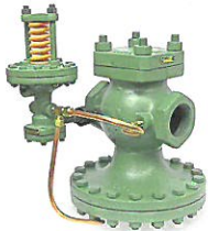
Pressure & Temperature Regulating Valves