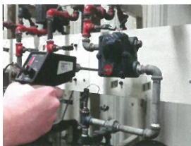
Steam Trap Testing and Rebates