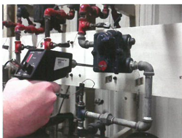
Steam Trap Testing and Rebates