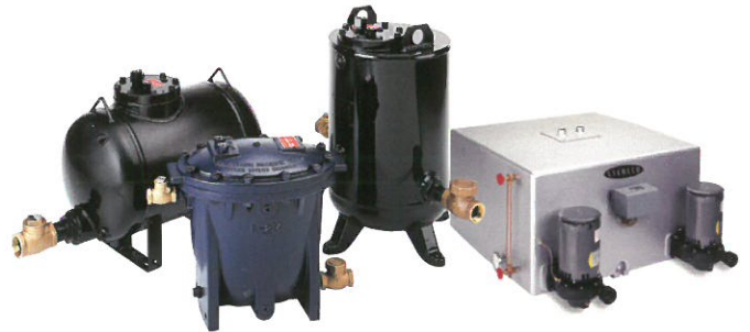
Condensate Handling Equipment