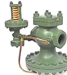
Pressure & Temperature Regulating Valves