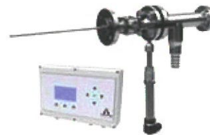
Steam Quality Metering