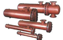
Shell & Tube Heat Exchangers and Bundles